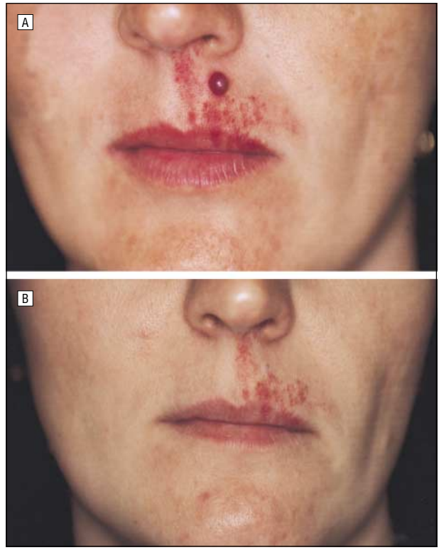
Figure 2. A, Patient with pyogenic granuloma on the upper lip. B, Status 5 weeks after a single therapy session with the continuous-wave/pulsed carbon dioxide laser. The lesion has healed completely without scars.

possible with other coagulating lasers (eg, argon and CW Nd:YAG), but when it comes to the delicate task of removing the basis of the lesion, vaporization in pulsed mode has proved to be advantageous. Extremely thin skin layers can be removed, thus allowing differences in skin levels to be gently evened out. This can only be achieved with pulsed CO_2 lasers.