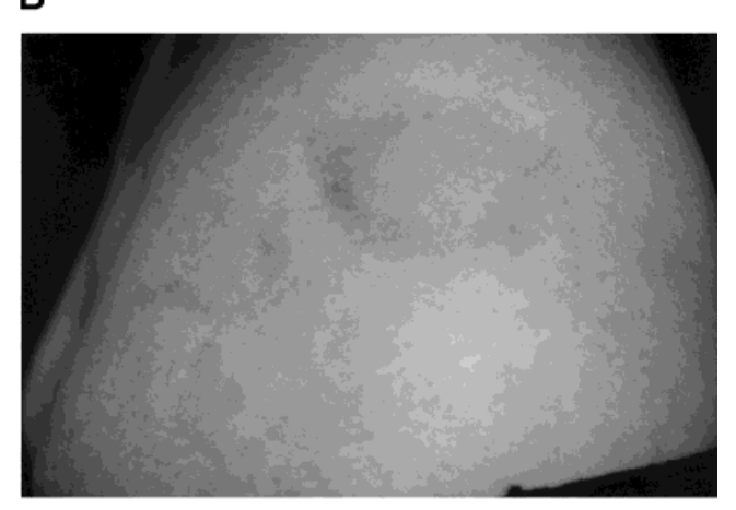
Fig. 3. (A) Circumscripted siderosis right-gluteal on a 24year-old female patient before therapy. (B) Visible lightening after one session with the ruby laser and nine sessions with the Nd:YAG laser.

However, a complete removal was not observed. This is probably caused by, as histologically proven, the fact that the iron pigment is pushed through the entire dermis to the border of the subcutis. Deep-lying iron cannot be reached by the laser and remains unchanged in the skin. The Q-switched Nd:YAG laser was often used on our patients (32 out of 47 laser sessions). Due to its longer wavelength (1064 nm), the infrared Nd:YAG laser is barely absorbed by melanin, is not scattered as widely by dermal collagen fibers and, therefore, penetrates deeper into the skin, as compared to the Q-switched ruby laser (694 nm; 1–2 mm) [17,18].