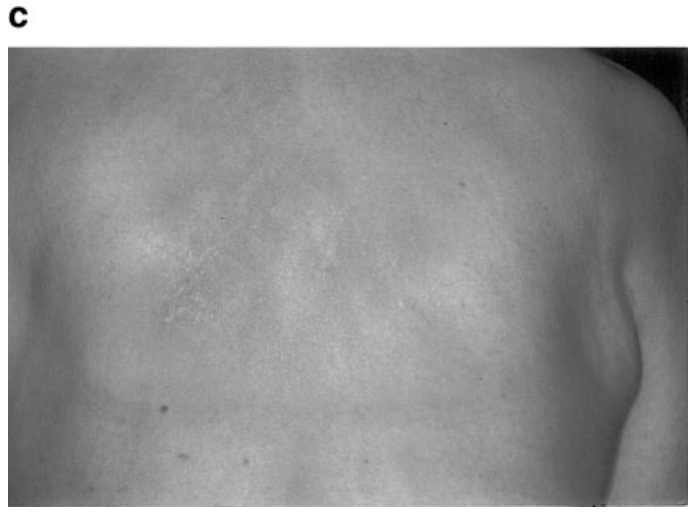
Fig. 2. a : Erythematous-livid plaques on the back of a 72-year-old female patient (02/1995). b : Status 2 months after the first laser treatment (09/1995). Marked skin changes visible exclusively in the areas treated with the laser. c : Status 44 months after the final dye laser treatment (02/2000).