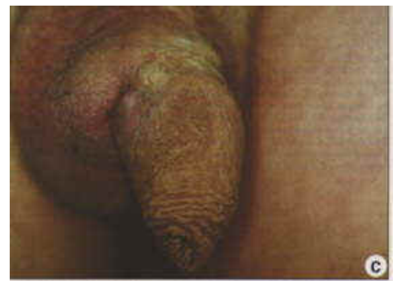
Figure 2. (A) Clinical picture of a vascular malformation of the penis and scrotum before treatment (patient 2). (B) Appearance of the lesion after two treatment sessions. (C) After four treatment sessions, the vascular lesion can no longer be observed.